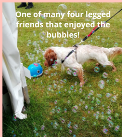
One of many four legged friends that enjoyed the bubbles!

We were delighted to unveil our new name and logo at the Suffolk Show this year. The opening day of the show fell on the 31st May, the date of us becoming an independent charity, so the timing was perfect for us. We held a very popular colouring competition of our new logo, and our stand had a sandpit, Duplo bricks and a bubble machine - it was a great opportunity for little legs (either 2 legs or 4!) to sit and have a rest, and for us to talk to their parents and carers about the services we have to offer. The weather was fairly kind to us and a good time was had by all.